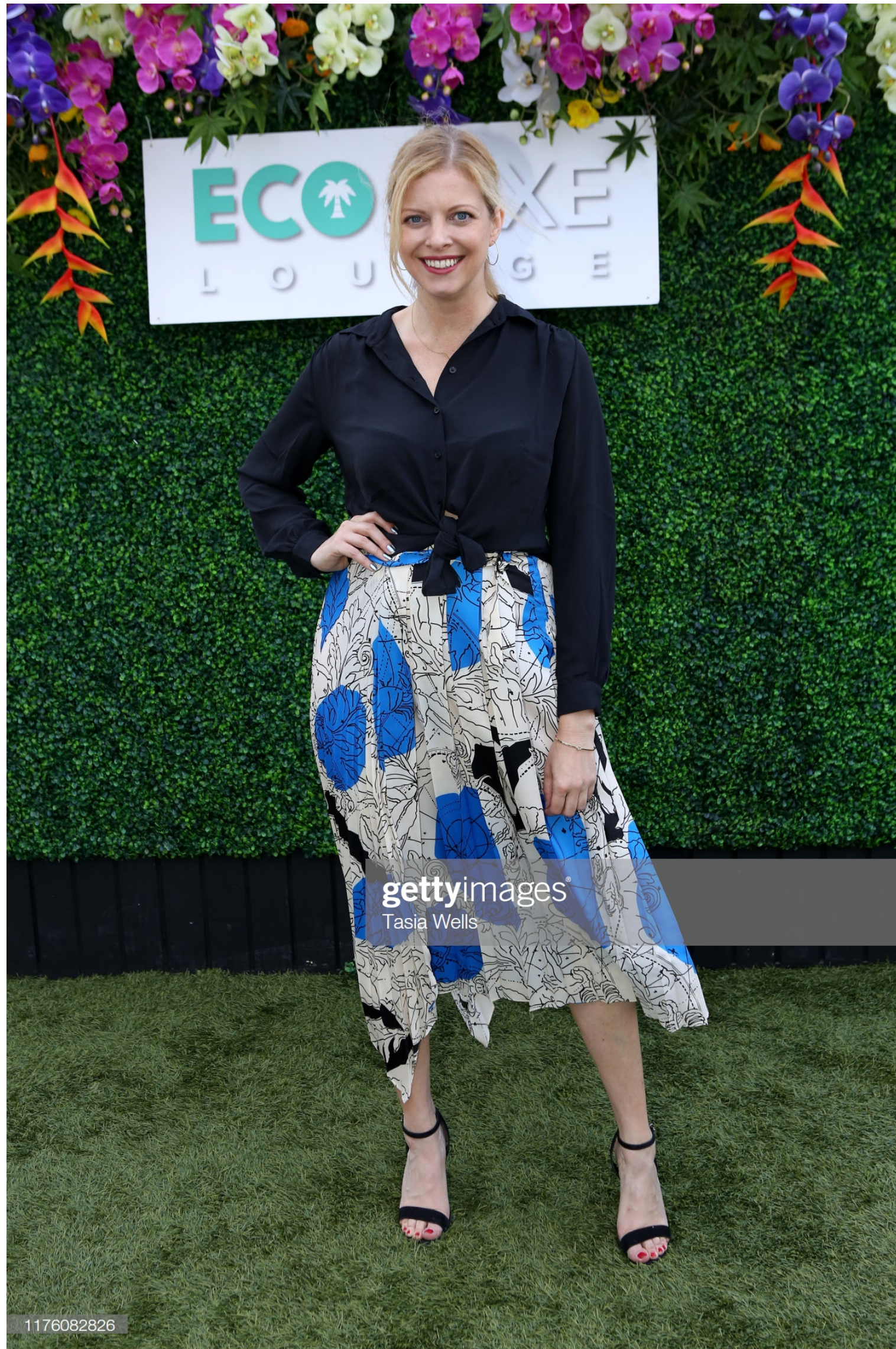
2019 EcoLuxe Lounge Emmy Gifting Suite