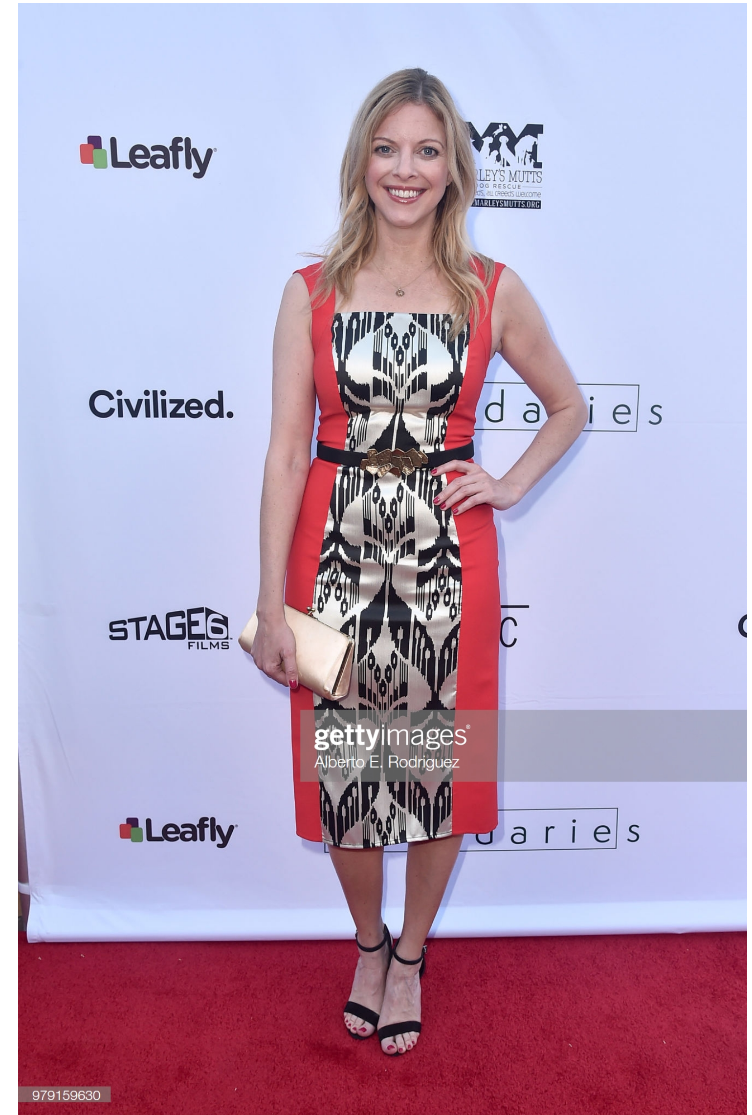
Premiere of Sony Pictures + Automatik's Boundaries